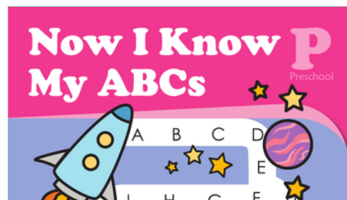
workbook Now I Know My ABCs