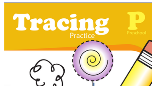
workbook Tracing Practice for Preschool